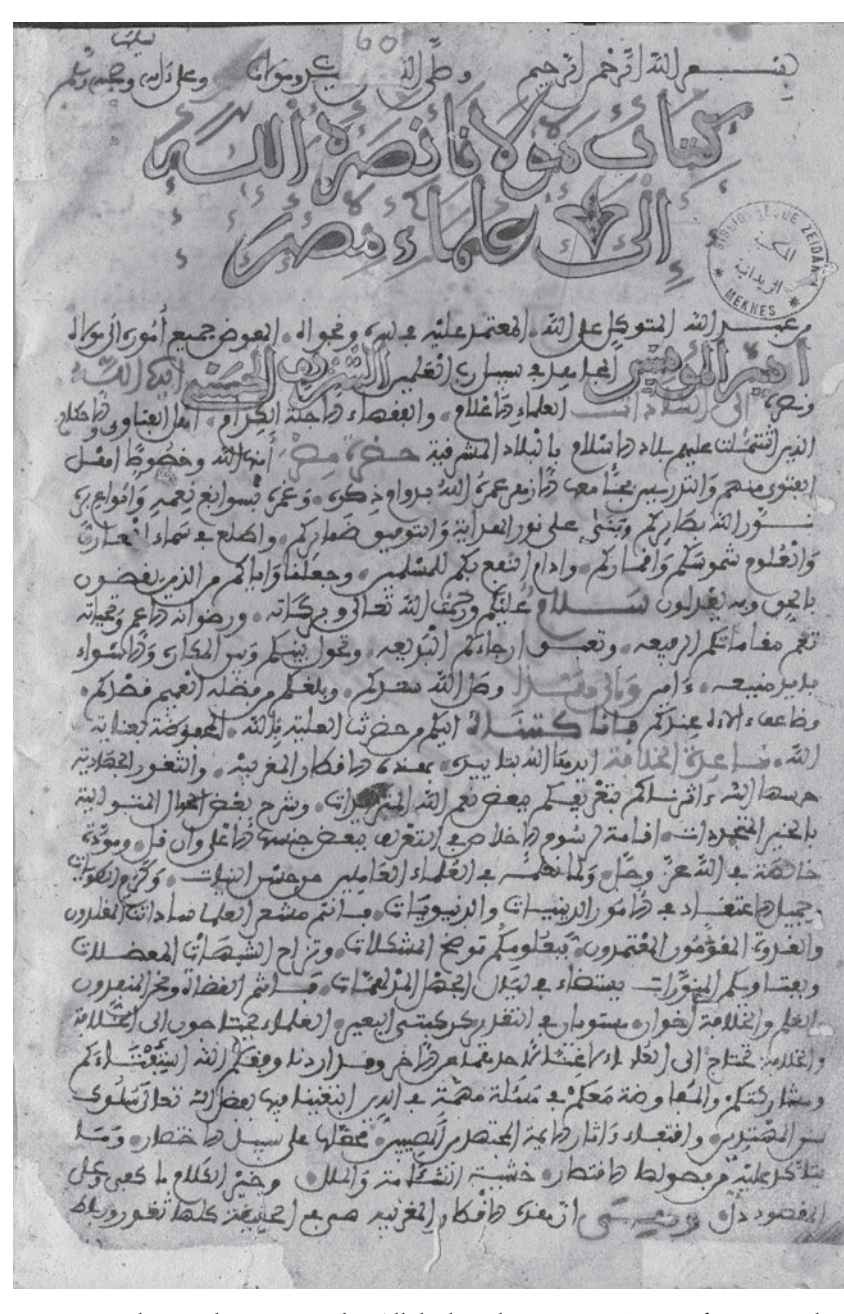
Figure. Kitab Mawlana Nasarahu Allah ila 'Ulama' Misr (Letter from Mawlay Isma'il to the Learned Men of Egypt).